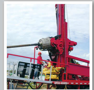
Tilt out carriage for all types of Sonic heads

Tandem axle truck, trailer, skid, or track mounted • Customizing obtainable