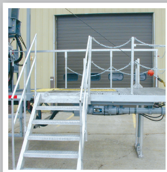
Aluminum Work Platform